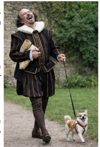
"The Winter's Tail" - village walkies

Certain dogs (e.g., restricted breeds such as XL Bullies) are legally required to be muzzled and on a lead in public under recent restrictions.