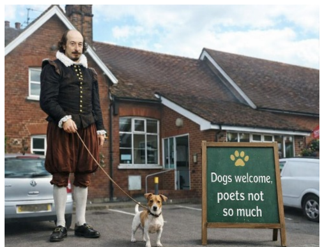
"You're Bard mate!"- A giant AI enhanced Shakespeare contemplates a small dog and an even smaller door.