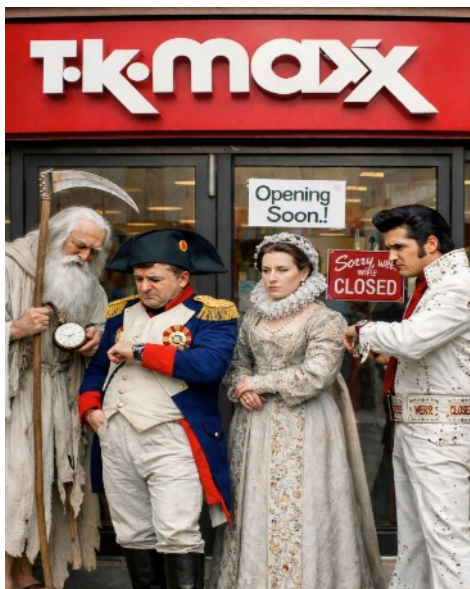
L to R: Time, Bonaparte, Scots and Presley all waiting for the store to open.