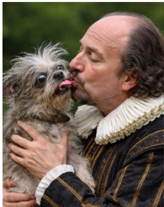
"Bard breath"-if only he could speak

these orders apply, and if you ignore them, you can be fined (typically a on-the-spot fine or more if prosecuted).